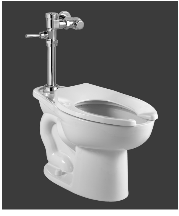
SEE REVERSE FOR ROUGHING-IN DIMENSIONS